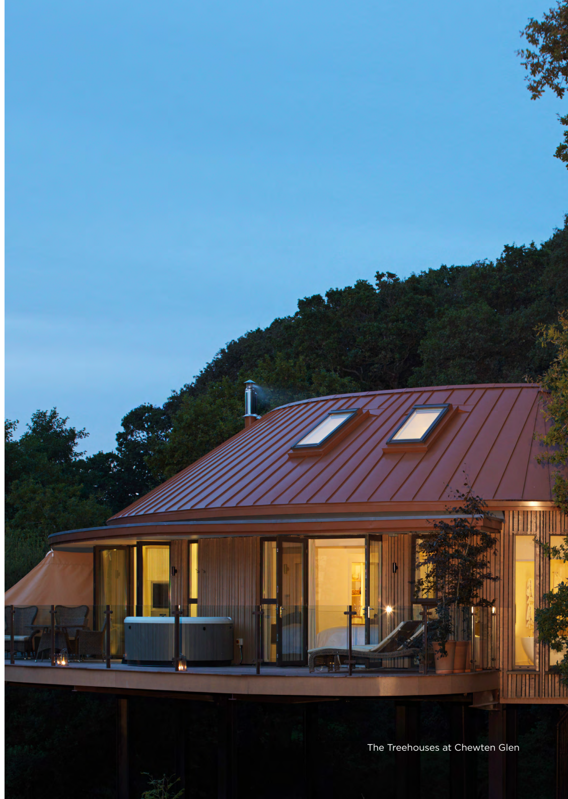
The Treehouses at Chewten Glen