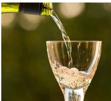
Enjoy English vineyard tours and tastings