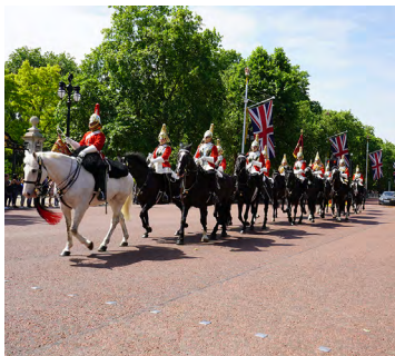
Changing of the Guard at Horse Guards Parade