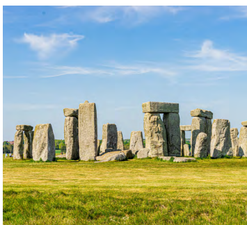
Visit one of the UK's many historical landmarks